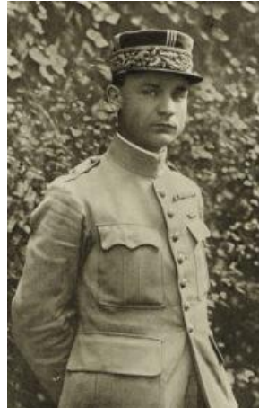
General Milan Rastislav Štefánik